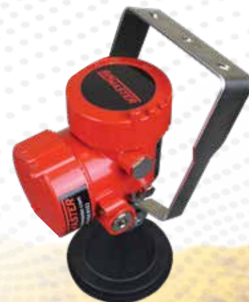
NCR-86 plastic horn model with mounting strap

For aiming flexibility, a 10° swiveling holder for the metal jacketed version of the NCR-80 comes in 4", 6", or 8" flange sizes to allow for precise aiming to the output of the vessel. For the NCR-80 plastic horn antenna version, 8° directional aiming is available with 2", 2.5", 3", 4", 5", 6", or 8" adapter flanges.