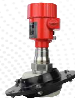
NCR-86 with mounting plate