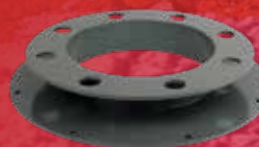
0° Mounting Plate