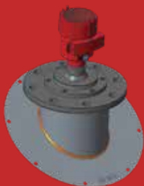
30° Mounting Plate with NCR-86 metal jacketed model

Not all roofs are flat throughout the process industries. Therefore, in addition to the affordable 0° mounting plate BinMaster offers 10°, 30°, and 45° mounting plates with a 4" ANSI flange.