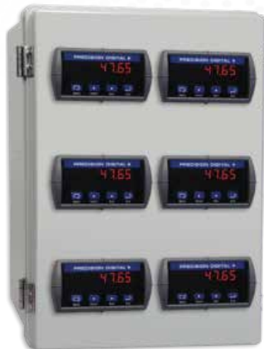
Local displays provide data access at ground level.

BinMaster offers several display modules to provide access to level data locally at the bin. This allows workers and drivers quick access to inventory levels from the ground or a vehicle. There is no need to visit a control room or the office. BinMaster will design a solution that fits your needs and budget based upon the number and location of your silos and where it is easiest to access data.