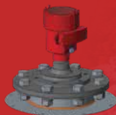
0° Mounting Plate with NCR-86 metal jacketed model