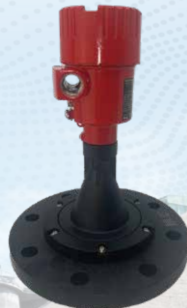
Plastic Horn Antenna