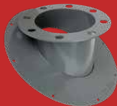
30° Mounting Plate